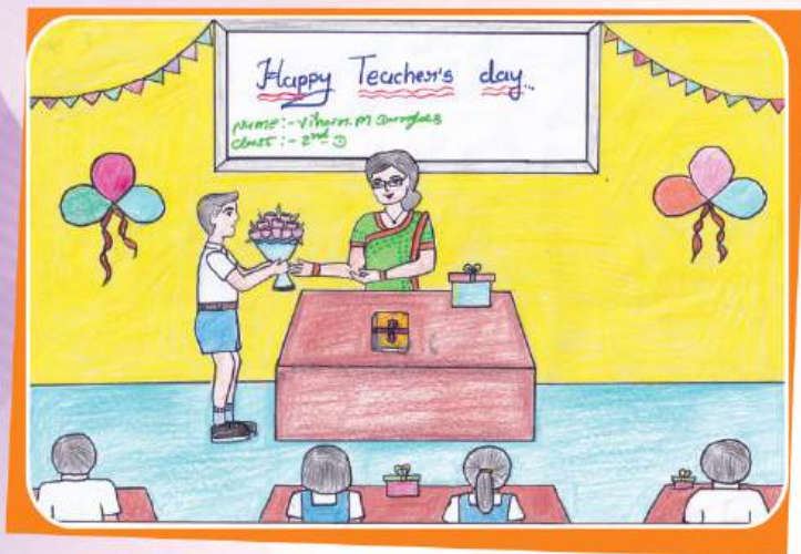
Vihan Dangar (2 D)