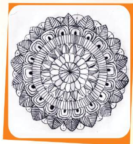
Rahi Bhanderi (2 D)