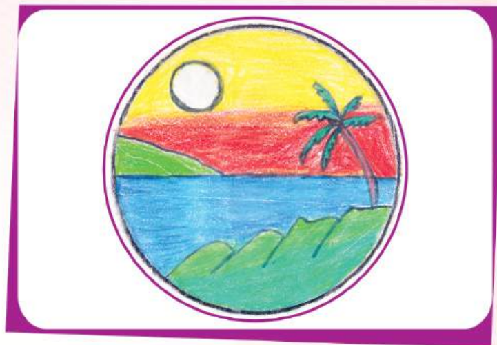
Jethva Ved (1 A)