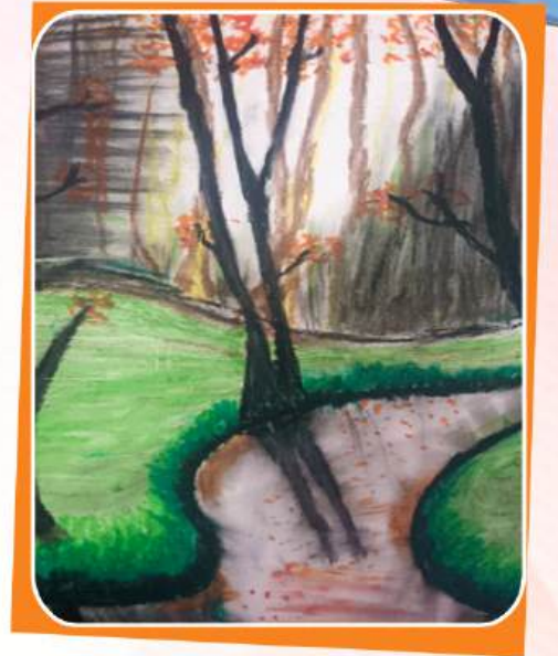
Rajvi Trivedi (6 D)