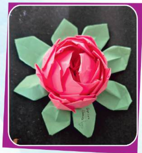
Savaliya Griva (2 C)