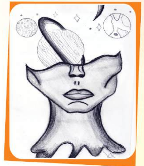
Jhanvi Siddhpura (9 B)