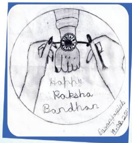
Paranjaysinh Raayjada (4 A)