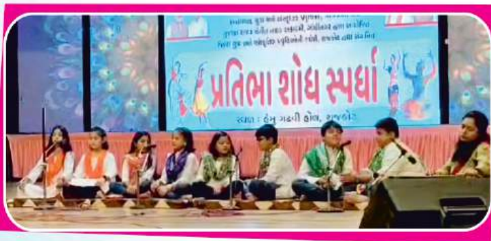
In Baal Pratibha Shodh District Level competition: Saint Mary's School secured First Position in Group Song