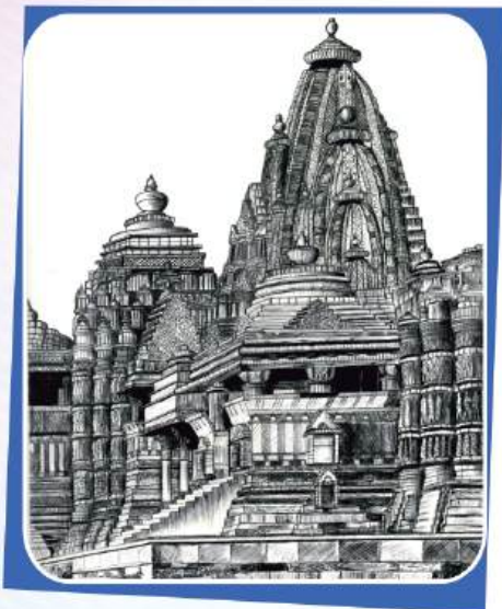
Dharmin Ghiyad (11 C)