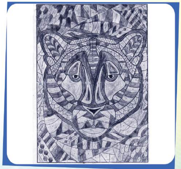
Raiyani Hetansh (2 C)