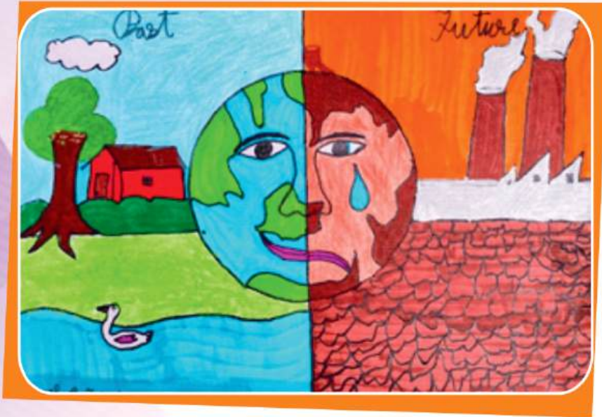
Darsh Trivedi (5 A)