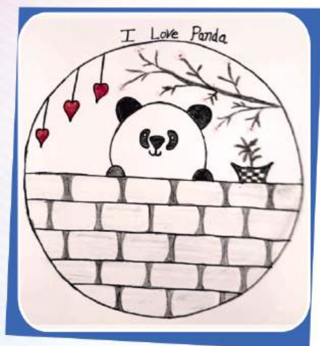
Vyas Prayag (2 A)